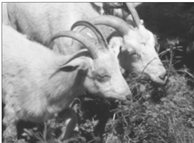
Goats prefer weeds to grasses. One of their favorites is leafy spurge.

One problem with using chemicals to control weeds is that they are trying to kill the symptom. Pesticides never take care of the problem. The problem is that there is a stress or a niche open on the land that needs to be filled with something good, something productive that you want.