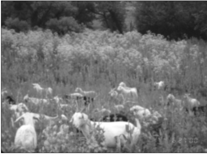
Teasel and poison hemlock grow so high, left, that the goats in the background are hidden. The goats eat the teasel and poison hemlock's flowers and leaves, allowing sunlight to reach the ground, right.