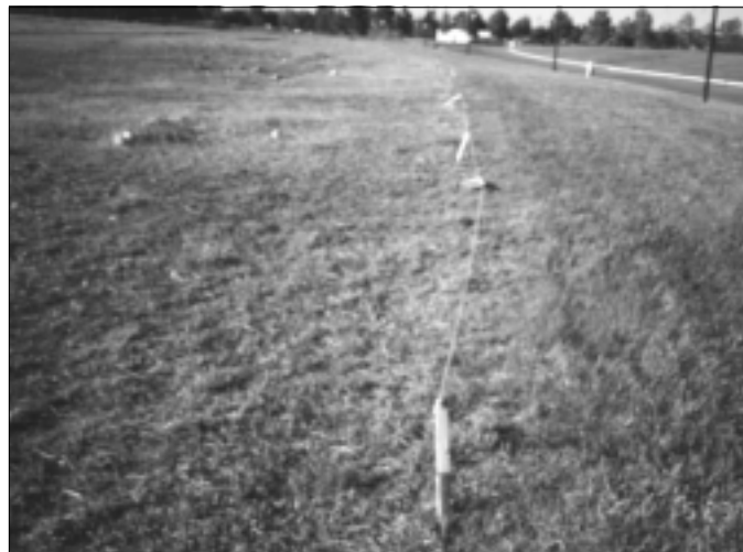
Goats grazing scotch thistle at the University of Colorado, Boulder campus grounds in late November 2000, left, stress the weed so much that grasses can successfully grow on the site the following May, right.

diffuse knapweed, the optimum time to graze is the first of June.