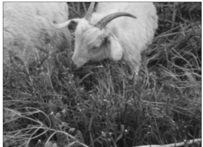
The white latex from leafy spurge oozes from where the goats have snapped off the tops of the plant. An enzyme in the goats saliva detoxifies the latex before they swallow it.

Timing of when to graze a weed is important to making the biggest impact. If wildflowers are your goal for the land, yet you have to control your noxious weeds by law, I would graze to stress the weed when the wildflowers were not yet in bloom. For