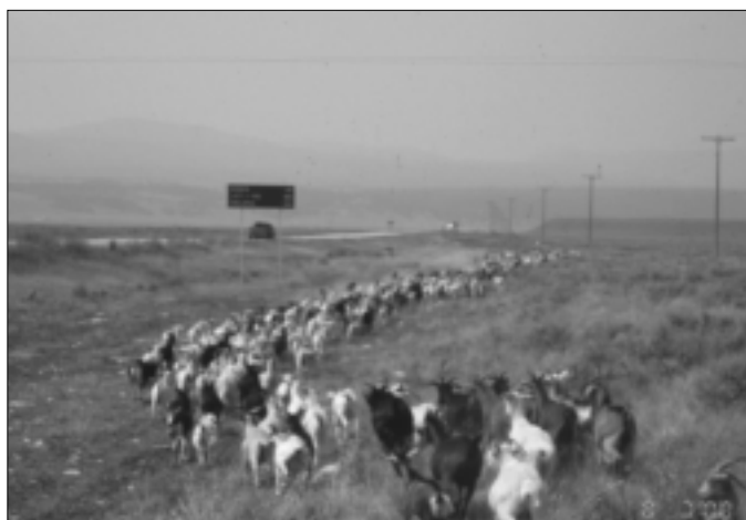
Goats graze a site covered with spotted knapweed.

Another way we handle the goats is by walking them. For one job, we walked 1,000 head of goats 35 miles down the right-of-way of Highway 287 on our way to a ranch in Enis, Montana. Every landowner along the way came out, saw what we were doing and hired us.