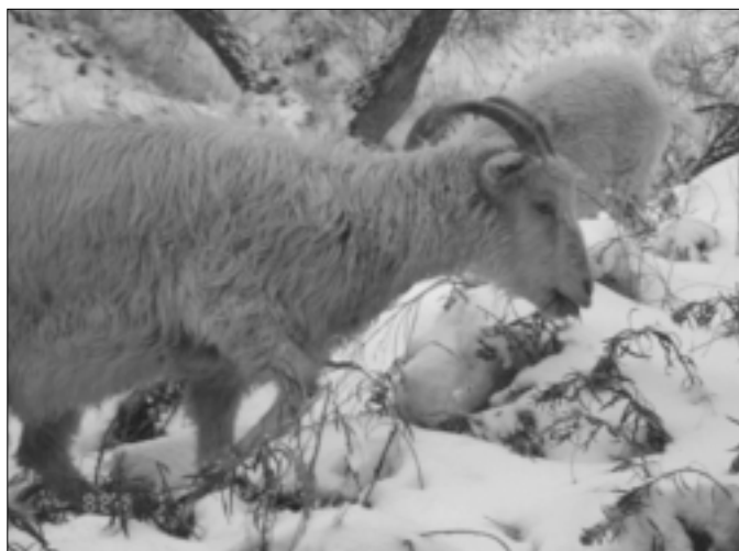
Goats can be used all year round to control noxious weeds. Here they dig out leafy spurge from under a snowdrift.

The extensive underground root system is also a spreading threat at the same time. Leafy spurge is capable of making an identical new plant far away from the mother plant. The root system goes down about 30 feet. It can grow in a crack in a rock, side of a cotton wood tree in the bark, or top of a cottonwood tree about 20 feet off the ground. What is the solution to leafy spurge in the cotton wood tree? Goats! Of course, leafy spurge is almost the goat's favorite food and they do climb trees.