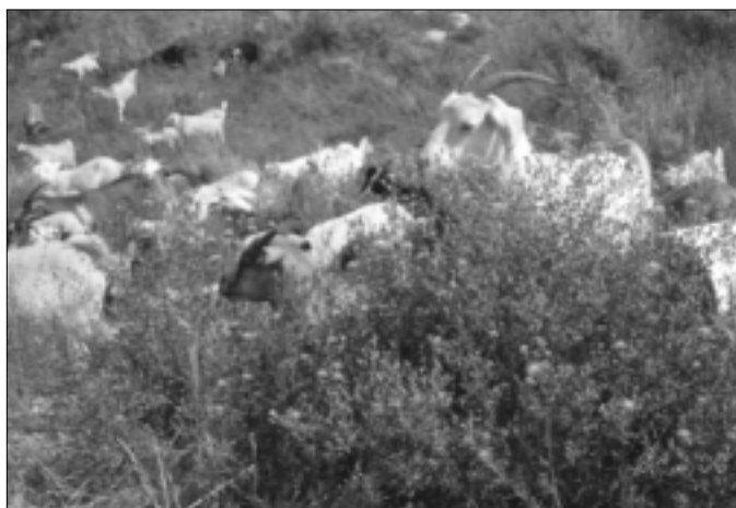
Goats graze a site covered with spotted knapweed.

The goats love Christmas trees, they clean it up, strip all the bark off. The remaining tree trunk could be sold to a youth group, to be cut, packaged and sold as firewood. So the recycling keeps going on and on through all levels of insects, birds, people and different groups of people.