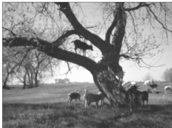
Goats will eat leafy spurge anywhere, even when it is growing out of the trunk of a cottonwood tree.

The goats seek out leafy spurge and eat it because they like it. When you look at a leafy spurge plant after the goats have grazed it, you can see where they have bitten the flower off, releasing a white latex substance. This white latex is supposed to make people go blind, cause rashes on hands, and cause blister on horses' feet. A little girl was sent to the hospital with third degree burns from the white latex getting on her legs. This substance is the reason why cattle and horses will not eat it. Cattle will not even walk into the