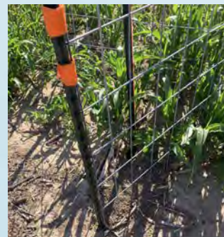
A soil moisture reader installed in Eastern Colorado as a part of the CO Soil Health Program