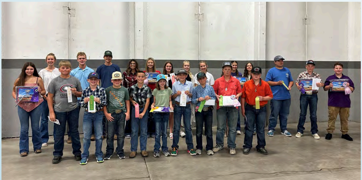
Carcass Contest Winners

The Weld County Fair Carcass Contest is a really great contest for our 4-H and FFA youth livestock exhibitors. It gives our youth another way to compete in the livestock project, that may not do well in the show ring. Its great to watch the smiles on the exhibitors that come about when reading off the top ten award winners in each species. If the carcass contest is new to you or you would have an interest in supporting the Weld County livestock program please consider making a donation to the carcass contest, it would really be appreciated.