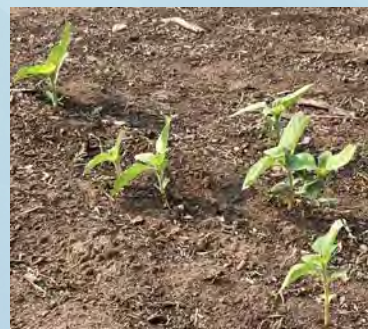
White Plumb Farm sunflowers emerging