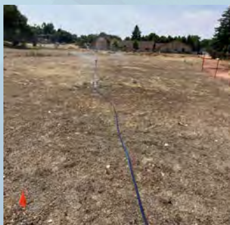
White Plumb Farm sprinkler set up