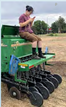
Taking a break to check plot map

Extension Specialists within Weld County and the Front Range partnered to conduct site visits for small acreage owners and advise them on the best management for their properties. Farm field visits were also completed in topics from crop loss evaluation to hay quality.