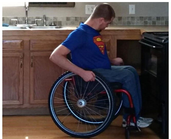
Weld resident inspects home

The program was designed to help maintain independence by increasing the safety of individuals living at home. Certain requirements must be met to qualify for the program as well as a consultation with the program coordinator.