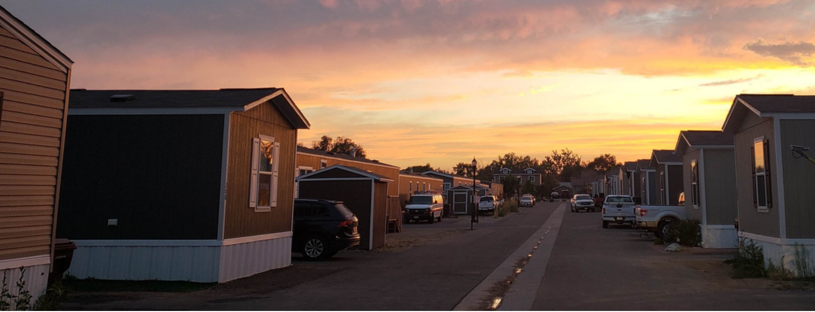
Mobile Home Park in Evans, CO