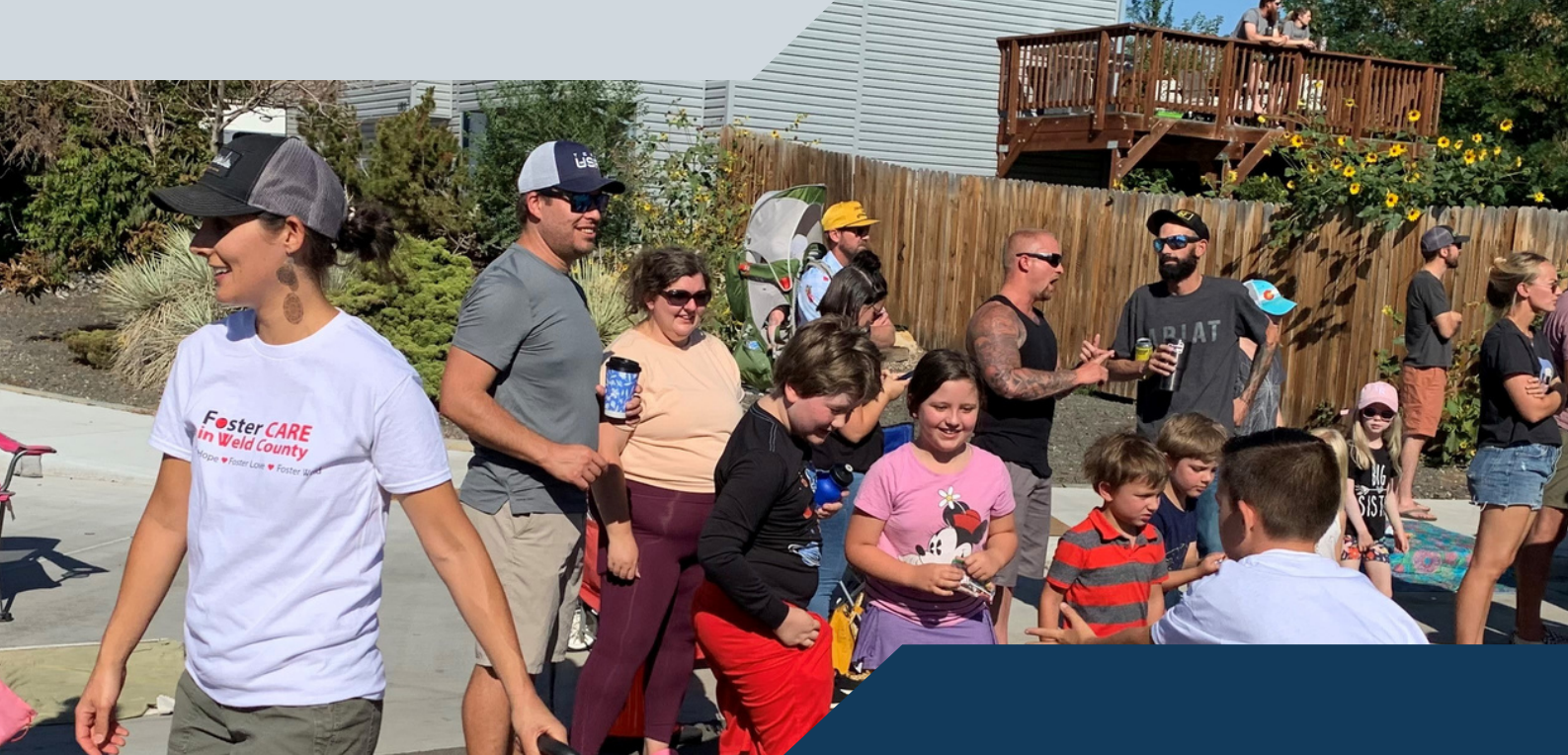
2022 Harvest Parade, Photo credit: Kristy DeAnda