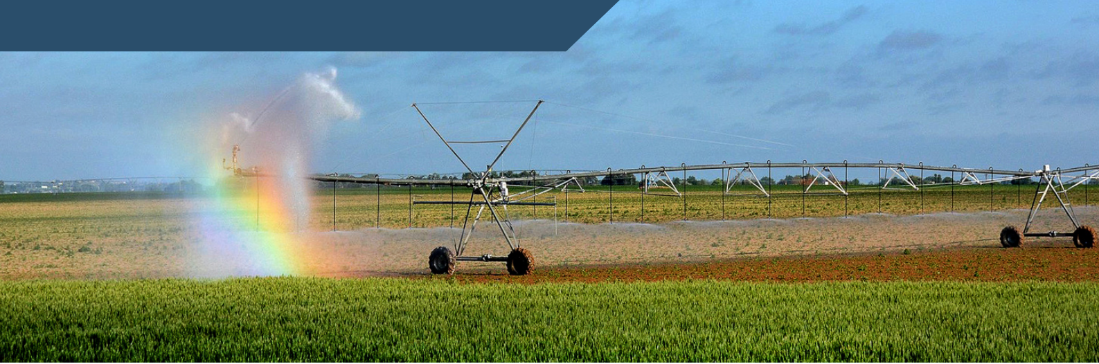
Weld County Farm