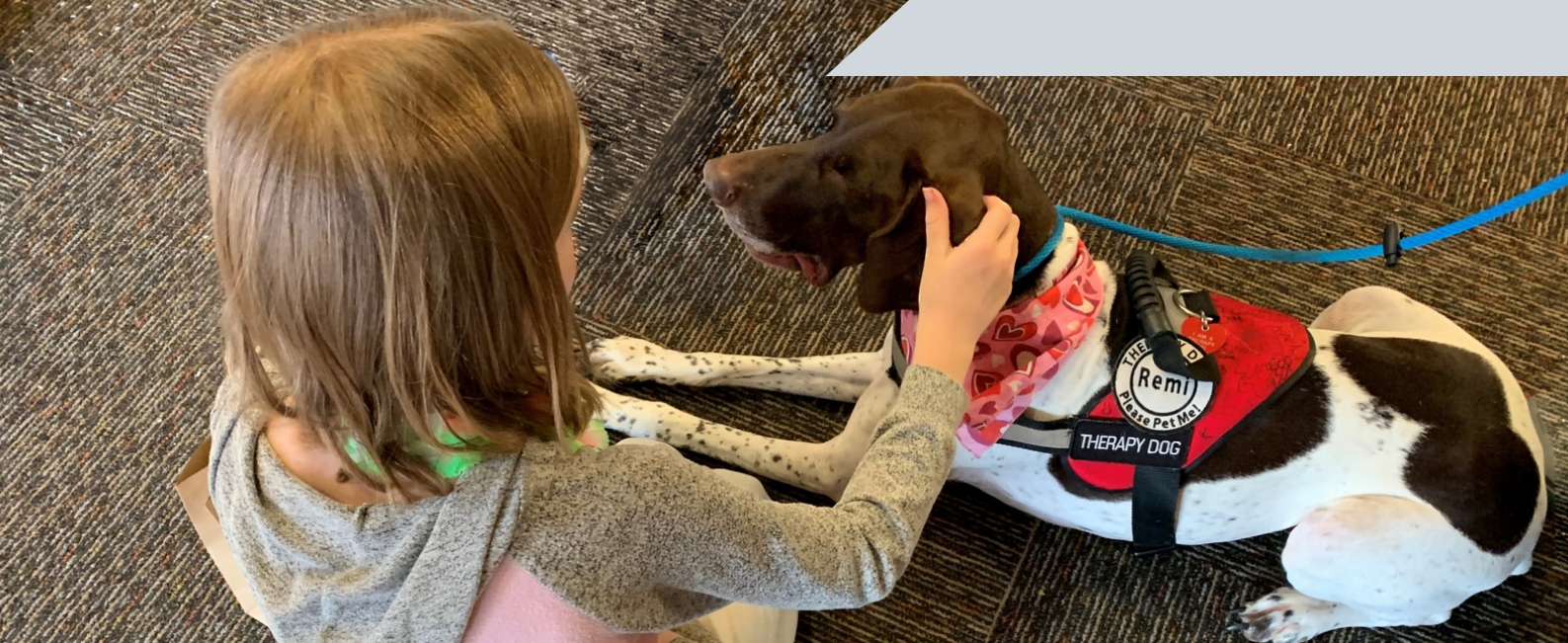
Parents Night Out