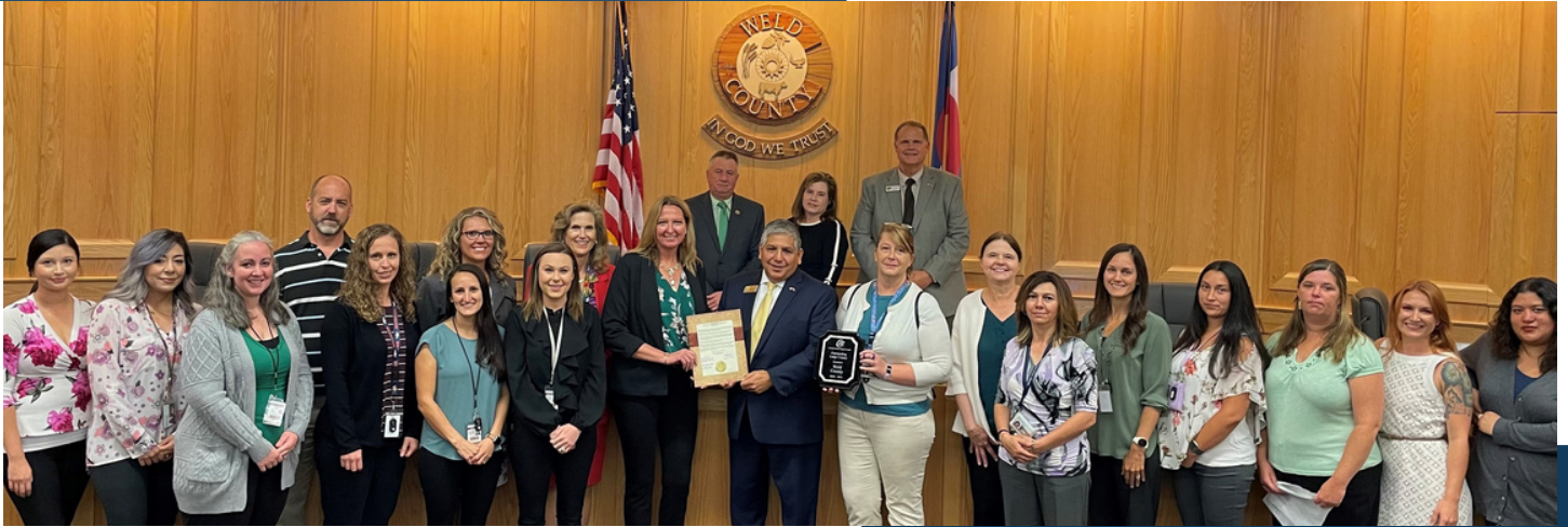
Child Support Division